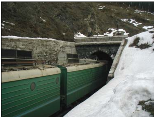
LIMITED (INSUFFICIENT) CLEARANCE PROFILE IN BESKYD TUNNEL