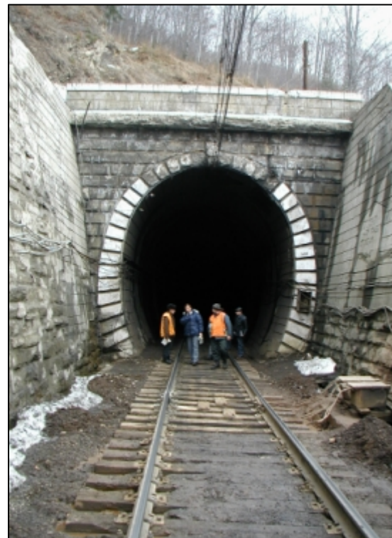
SOUTH PORTAL OF BESKYD TUNNEL