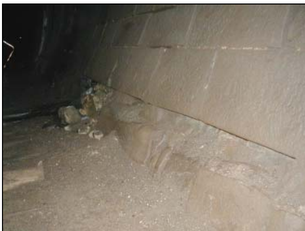
PARTLY BROKEN/ERODED STONES AT FOUNDATION LEVEL