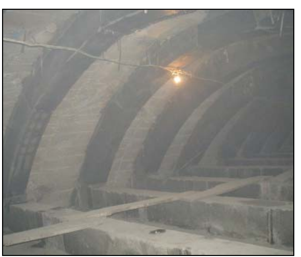
REINFORCEMENT RIBS IN AIR DUCTS