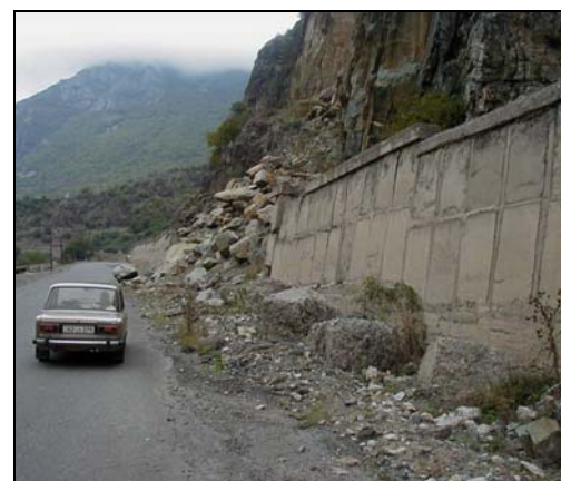
DAMAGED RETAINING STRUCTURES