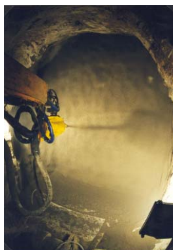
Fig. 2 Application of sprayed SFRC