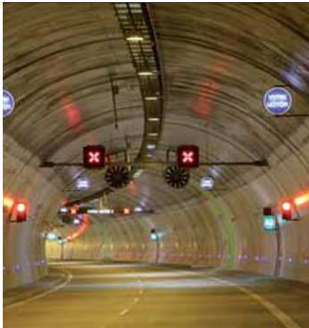
Fig. 3 The Klimkovice tunnel secondary lining

reinforced concrete. It is minimally 350 mm thick (in the crown of the arch), with a massive invert with a maximum thickness of 1.2 m. The secondary lining is divided according to the casting procedures into 12 m long expansion blocks. The vaults are supported with longitudinal foundation strips, with articulated joints at the expansion joints of the vaults. As a fire protection measure, fire resistance of the concrete lining was increased by adding polypropylene fibres to the mix. In addition, chloride resistance was enhanced in the most exposed sections by means of concrete aeration.