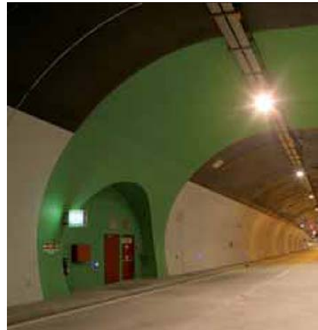
Fig. 4 The Klimkovice tunnel lay-by