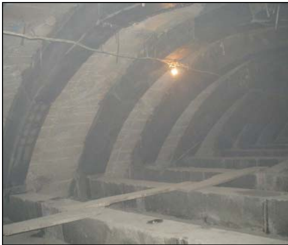
REINFORCEMENT RIBS IN AIR DUCTS